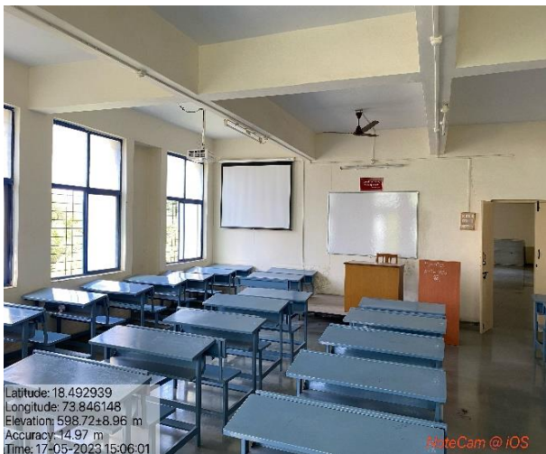
Class Room 403