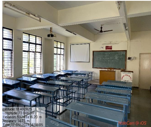
Class Room 303