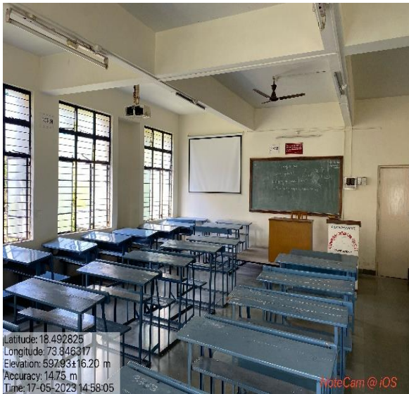
Class Room 401