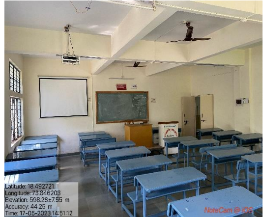
Class Room 102