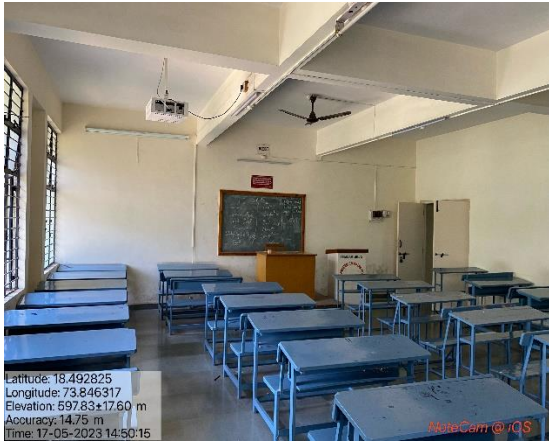
Class Room 101