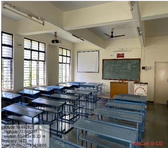
Class Room 302