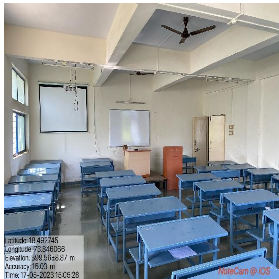
Class Room 402