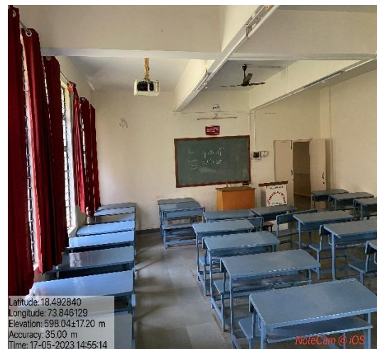
Class Room 203