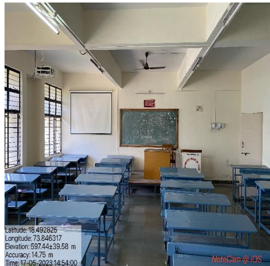
Class Room 201