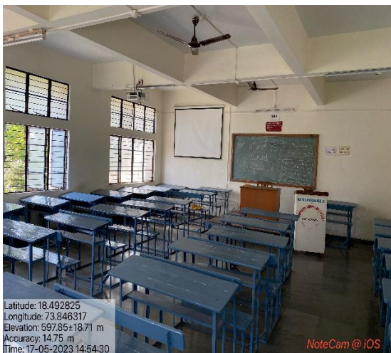
Class Room 202